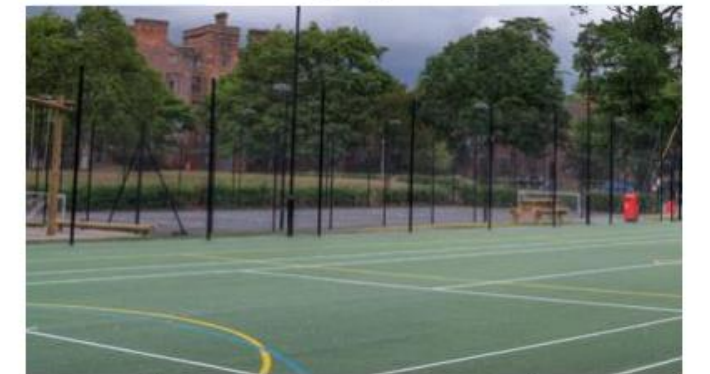
All weather sports pitches