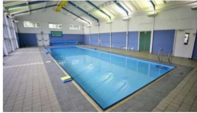
Indoor swimming pool