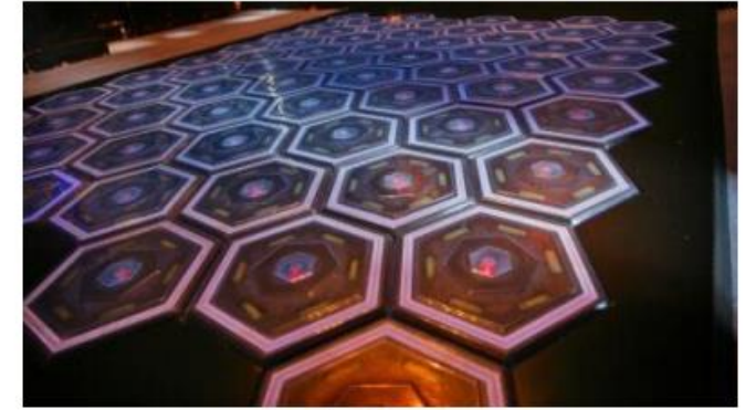
Grid of stones