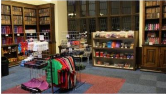
Tuck shop/Gift shop